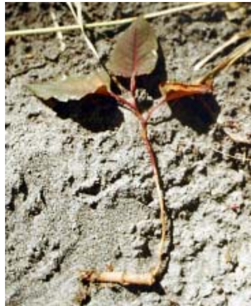
Photo 9. Root fragment sprout.

Knotweed can spread rapidly due to its ability to reproduce vegetatively. Root and stem fragments, as small as 1/2" (1 cm) can form new plant colonies (photograph 9). Seasonal high water events and floods sweep plants into rivers and creeks, then fragment and disperse knotweed plant parts throughout the floodplains and cobble bars. The fast growing knotweed then takes advantage of the freshly disturbed soil to become established. Because it grows faster than most other plant species (including native species and most other weeds) it quickly outgrows and suppresses or kills them.