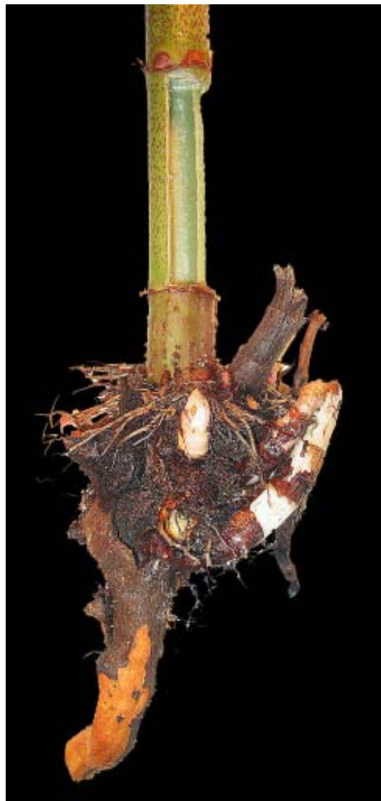
Photo 12. Close-up of lower stem/ root/rhizome structure with section cut-out to expose hollow cavity. Note numerous buds at root crown.