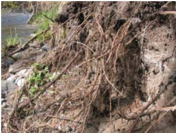
Photo 7. Tangled mass of knotweed rhizomes growing within an eroding river bank. Despite knotweed's large rhizome mass, it provides poor erosion control.