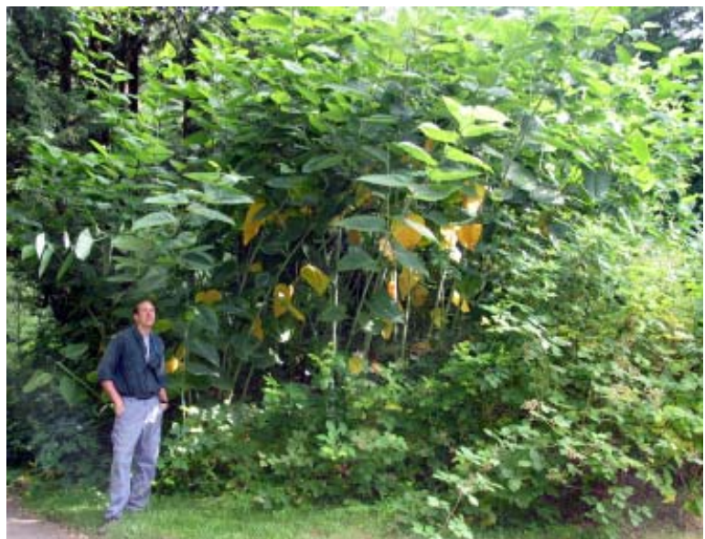
Photo 6. Giant knotweed patch

In the Pacific Northwest (PNW), at low elevation, knotweed typically starts growth in April, earlier in warm areas, and as late as June at higher elevations. Even at low elevation, stems from deeply buried roots may emerge as late as July or August. Knotweed grows extremely fast during the spring. Giant knotweed can reach 15 feet (4.5 meters) by June (photo-graph 6). The slightly shorter Japanese knotweed reaches "only" 10 feet (3 meters) or so. The "dwarf" Himalayan variety is shorter still, typically reaching 4-6 feet (1.5 - 2 meters).