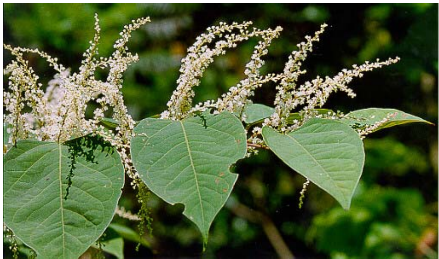
Photo 4. Flowering knotweed branch

The stems are often reddish or red-speckled (photograph 2). Young shoots look similar to red asparagus (see photograph 12). The small white or greenish flowers form in dense clusters from the leaf joints (photograph 4). Although it dies back to the ground after hard frosts, the stems may persist through the winter as bare, reddish brown stalks (photograph 5).