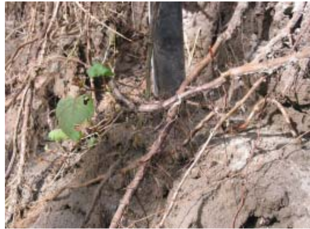
Photo 8. Close-up view of rhizomes with machete in background for comparison. Note small shoot growing "in the air."

Knotweed is a creeping perennial. It dies back to the ground with the first hard frost, and returns each spring from the same root system. The term "creeping" refers to the extensive network of rhizomes (roots that can sprout) spreading at least 23 feet (7 meters), and possibly as far as 65 feet (20 meters) from the parent plant and penetrating at least 7 feet (2 meters) into the soil (photographs 7 and 8).