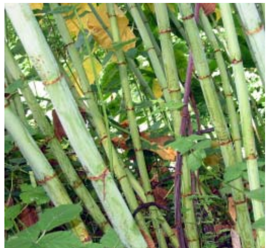
Photo 2. Knotweed canes

The large, smooth-edged leaves range from an elongate triangle (Himalayan knotweed), through heart shaped (Japanese knotweed) to huge, “elephant ear” type leaves (photograph 3). Hybrids blur these distinctions.