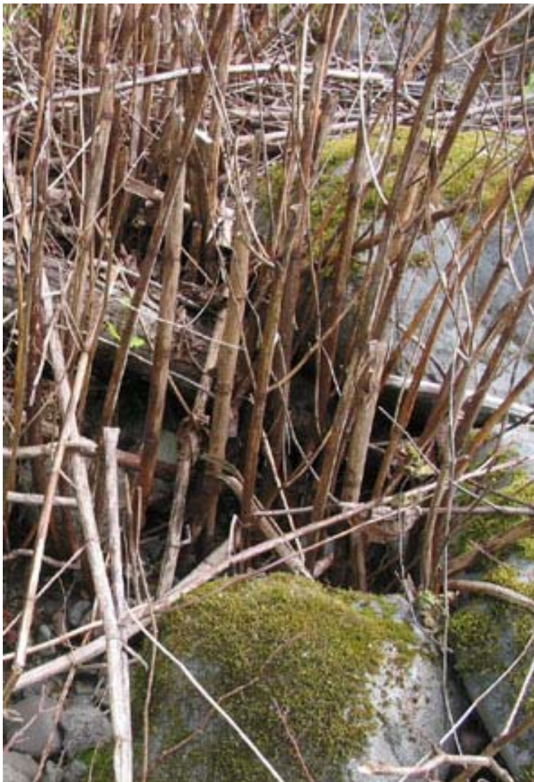
Photo 5. Dead and persistent knotweed canes

Prostrate knotweed, a common weed in the Polygonaceae family, is not addressed in this document. References to “knotweed” pertain exclusively to Japanese, giant or Himalayan knotweed or their hybrids, unless otherwise noted.