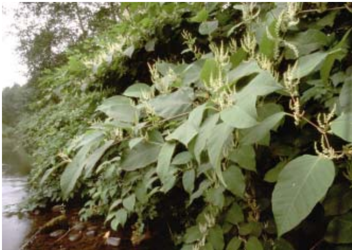
Photo 1. Knotweed infested stream bank

Japanese, giant and Himalayan knotweed are members of the buckwheat family (Polygonaceae) from Asia with hollow (not true for the Himalayan species), upright, bamboo like stems growing to 1 to 5 meters (3 to 16 feet) (photographs 1 and 2).