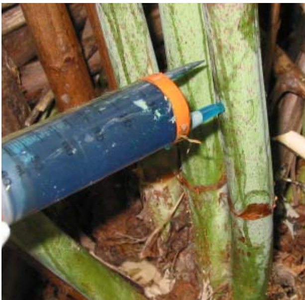
Photo 11. Stem injection with plastic syringe

Injecting concentrated herbicide directly into the hollow of the lower nodes of knotweed stems is an experimental method showing great promise in trials conducted under experimental use permits from the states of Oregon and Washington (photographs 11 and 12). Although time consuming, not only does this approach essentially eliminate drift, but Clark County (WA) Weed Management reports obtaining 100% control in one treatment by injecting 5ml of 100% Aquamaster or Round Up Pro into each stem of a given clump. More than 20 patches were so treated (please visit www.co.clark.wa.us/environ/knotweed.pdf for more information).